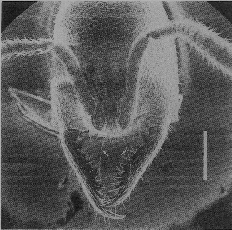
Fig. 2. Head of A. silvestrii worker. Dorsal view. Arrows indicate a pair of hairs protruding from the anterior margin of the clypeus. Scale=0.25mm

With the prey completely paralyzed, the retrieval starts. The huntress first leaves the prey and conducts an orientation trip in order to check the position of the nest entrance. Then she returns to the prey and drags it over several centimeters. Again she releases it and proceeds singly to the nest. Such orientation and prey dragging are repeated alternately until the prey is brought in the nest (Fig. 3E). Although the whole process of this transport can be completed by only the huntress despite large prey size, other workers in the arena are sooner or later attracted to the prey, and join the transport. In such cases, the original huntress often deserts further execution, which is taken over by the newcomers. When the huntress on the way of an orientation trip enters the nest chamber, other workers often show vibration displays to her, who may also respond similarly with the same behavior. Furthermore, nearby workers carefully examine her body with the antennae, and some of them may even become aggressive and nudge the huntress with the mandibles open. This aggression is provoked probably by prey odor attached to her surface. Following this, some of such aroused workers may leave the nest, but in the present study no guiding behavior has been noticed in the original huntress. There is therefore no indication of recruitment to food source in A. silvestrii .